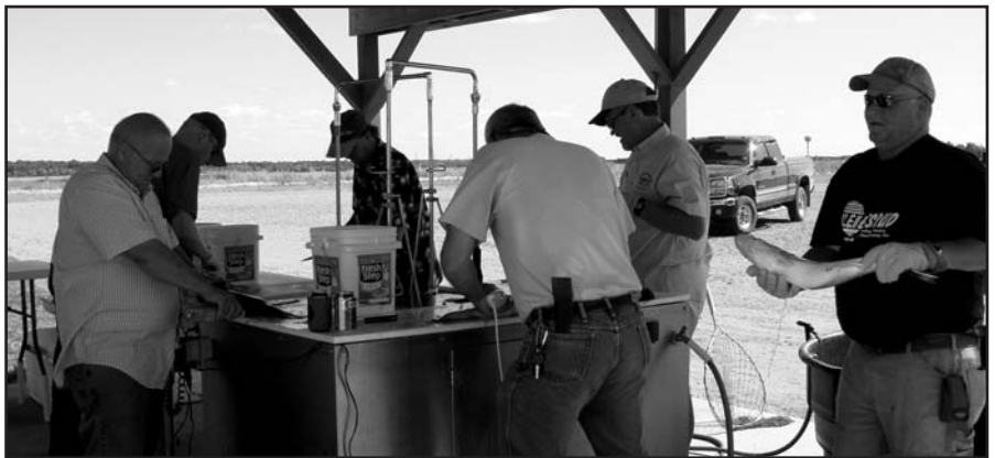
LRAA Volunteers clean fish for the Cabela's National Team Championship

Lake Region Anglers cleaned fish for the MWC/NTC tournament in July. Over 1300 big walleyes. It was quite a project and thanks to the many volunteers it went very well. We used the fish to feed over 700 people at the Fish Fry and Corn Feed in August. Below are listed the volunteers that helped with one or both of the events. If you see them tell them thank you.