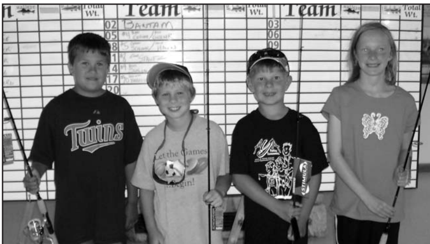
Adult Child drawing winners