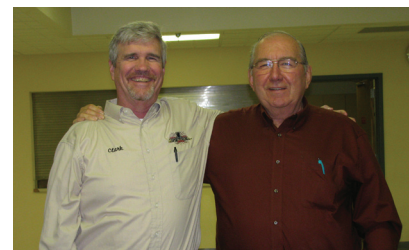
We look forward to seeing you on Saturday, April 20th at the Sportsmen's Smoker & Raffle!

North Dakota's Game and Fish Department is justifiably proud of the fact that as the smallest Game and Fish Department in the country, they have been able to develop the outstanding resources that we have on a very limited budget. If we want to keep our fisheries, we will need to increase the staffing and budget of the Game and Fish Department significantly. Raising our license fees to be at least competitive with surrounding states is a first step. We as fishermen need to continue to let our Governor and Legislators know how important these resources are and that we want them protected AT ALL COSTS. Business as usual is no longer an option.